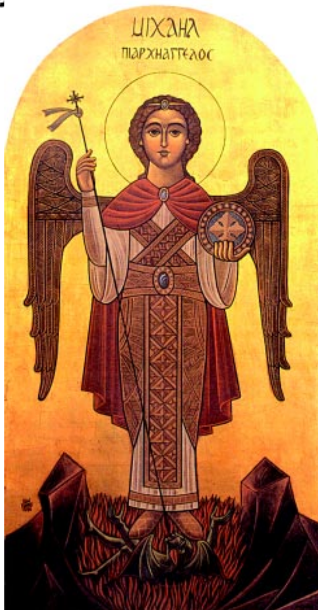
Archangel Michael “Captain of the Heavenly Hosts”