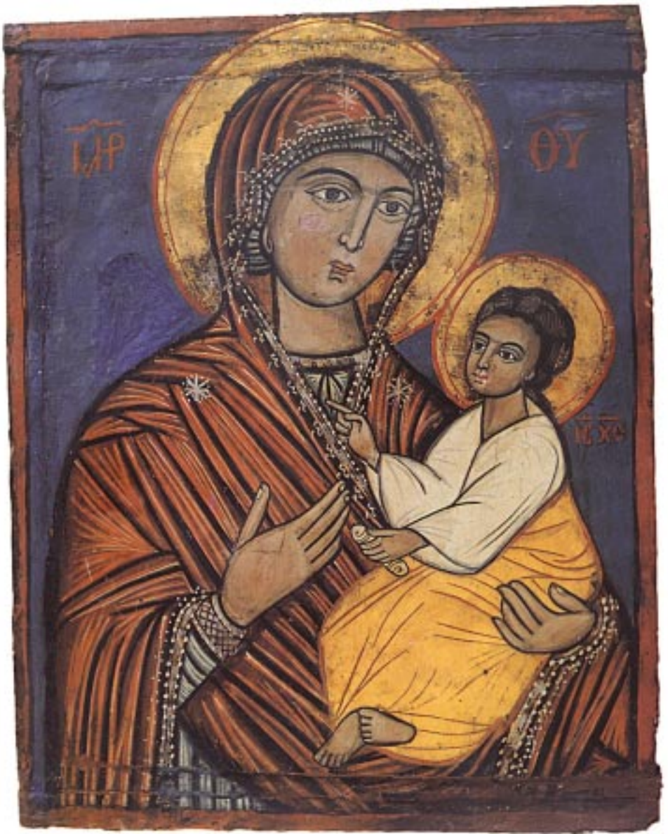
St. Mary carrying the Child