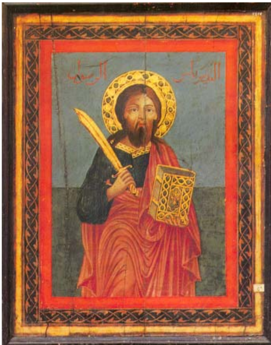
Saint Paul the Apostle