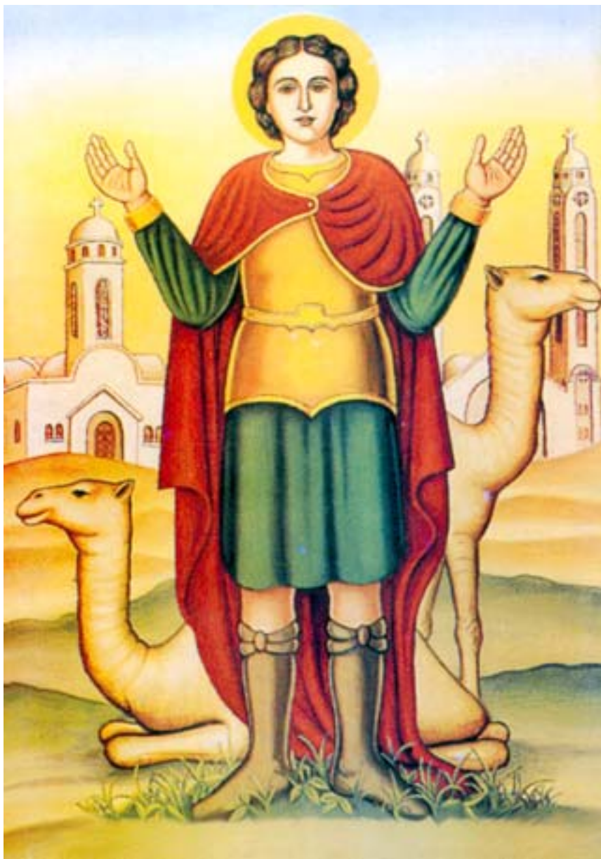
St. Mena the Martyr