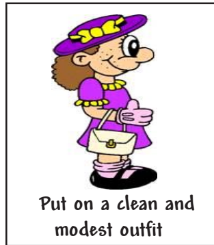
Put on a clean and modest outfit