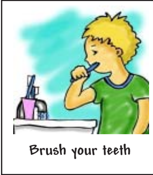
Brush your teeth