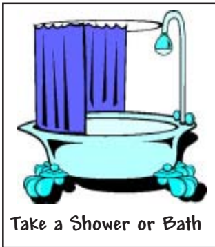
Take a Shower or Bath