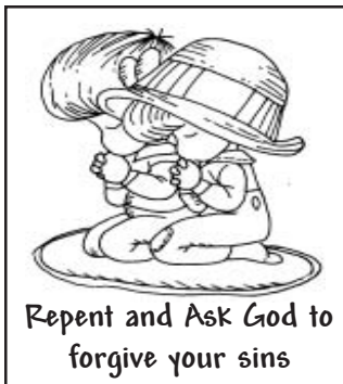
Repent and Ask God to forgive your sins