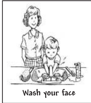
Wash your face