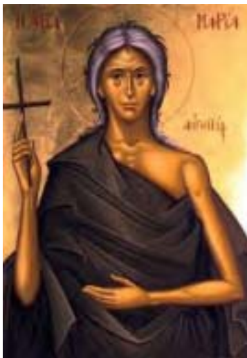
St. Mary of Egypt

After arriving in Jerusalem she persisted in her shameless life, and on the Feast of the Exaltation of the Holy Cross, joined the mass towards the Church, hoping to meet some new victims whom she might draw into sin. When St Mary reached the door of the Church, she suddenly felt herself repelled by some mysterious force, and having vainly attempted three or four times to enter, she retired to a corner of the Churchyard, and was struck with remorse