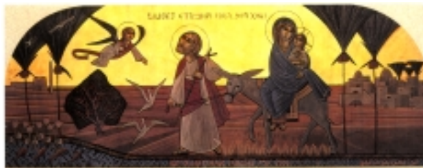
The Holy Family in Egypt

to Rome. Rome's population was near one million and as the food shortage in Rome grew, the empire needed Egypt's exports. Due to the fear of riots which almost always followed food shortages, the emperor Augustus gave the order to the governor of Egypt to send a shipment of wheat to Rome every year whose average was "850,000 ards" (Egyptian measure of wheat).