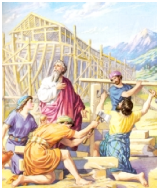
Noah, Shem, Ham, Japeth

In Egypt, many cultures were established since 5000