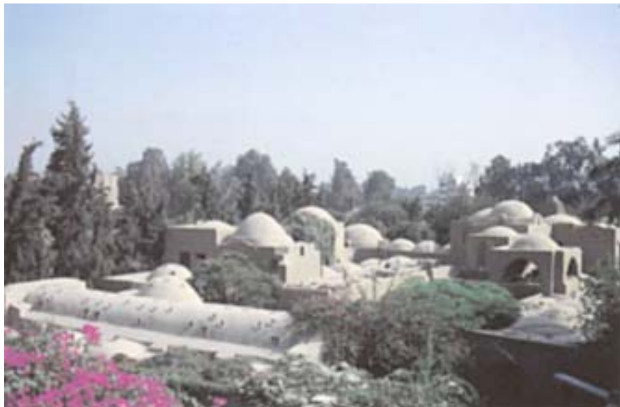
Church of St Mary

The second stage entails the church governed by written law that was given to Moses containing all the moral, civilian, and ritual laws. These laws were a magnified sign for the conscience that had deteriorated as a result of the moral corruption of man. God gave