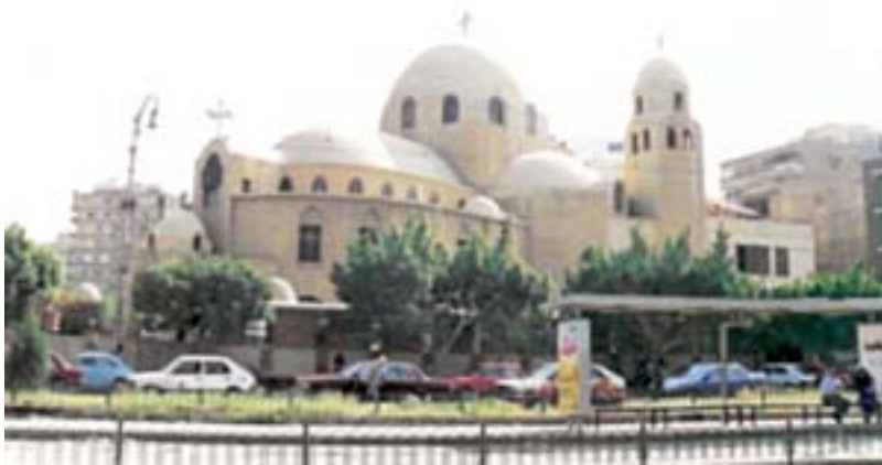
Church of St George

head of this body is the Lord Jesus Christ Himself (Matthew 25:5-6, John 4:29, I Corinthians 12:27, and Colossians 1:24)