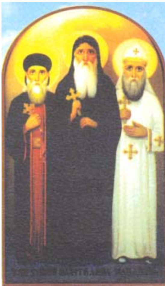
The Three Saints Abba Macarii (of Egypt, of Alexandria, the Bishop of Edco).