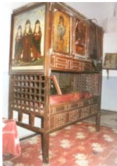
The relics of the three St Macarii

what are these vessels that you are carrying and what is the feather in each." The man replied, "I am the devil whom they call the devious one, and I draw people to sin by means of these vessels. I deceive each member of the body as befits it, and I rejoice in the falling of those whom I overcome.