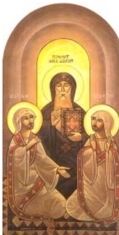
St Macarius (center), St Maximus & St Dometius

After the saint had settled in Sheheet for a while, the devils arose in the shape of beasts and surrounded him intending to devour him, but the Lord did not permit them to harm him lest the saint be discouraged or dismayed. On another occasion the Lord gave