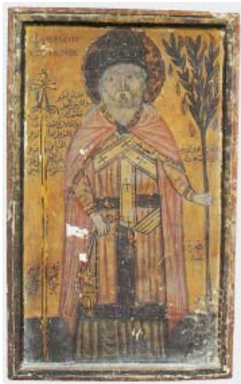
St. Ephraim the Syrian holding a censer in his right hand and the trunk of a Tamarind Tree in the other, “St. Ephraim’s Tree.” (Dair Al Suryan)

St. Augustine stated, “To have the salvation and eternal life, the Lord Christ should be your head and no one could do this if he is not united in the Body of Christ which is the Church.” St. Cybrian said, “Who, the Church is not his own mother, could not have God as his Father. As those outside Noah’s Ark could not be saved, so everyone outside the Church will not be saved.”