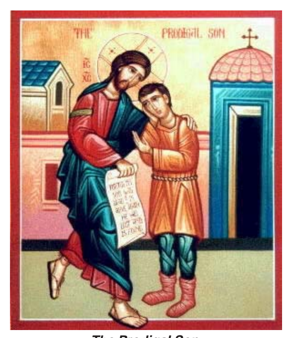
The Prodigal Son

From the physical point of view, confession is very important. Confession has many blessings for our body, for we know from the Holy Bible that the cause of some diseases was sin, as in the case of the sick man of Bethesda. (John 5:14) Therefore, our church teaches that the sick person, to whom the priest will perform the Sacrament of Unction, has to confess his sins first before he is cured of his disease.