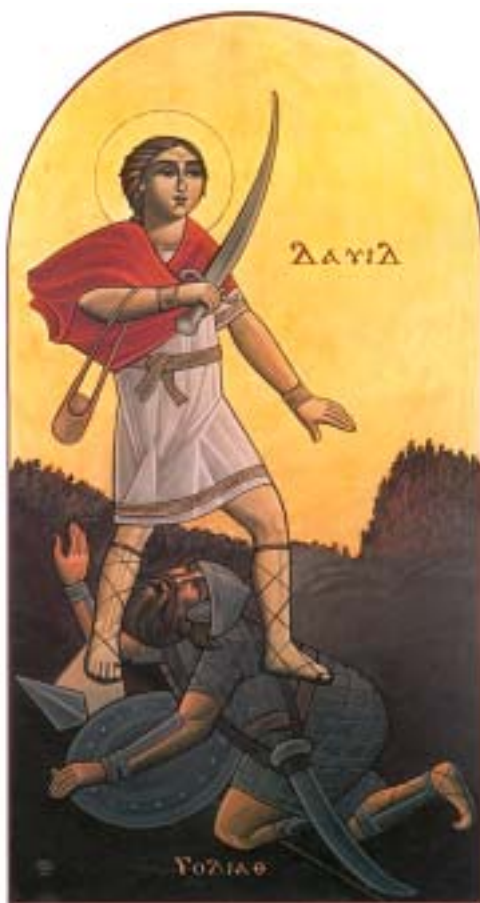
David defeating Goliath

May the fire of the Holy Spirit grow inside of you as it did inside these blessed youth.