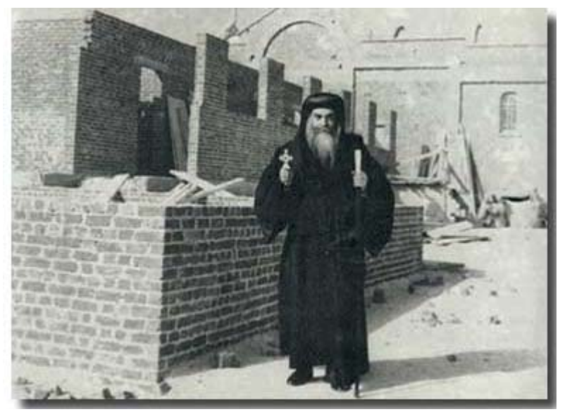
Among the new establishments of the new St. Mena Monastery.

The appearance of the Virgin Mary at her church in Zeitoun (a suburb of Cairo) was a unique spiritual event that crowned