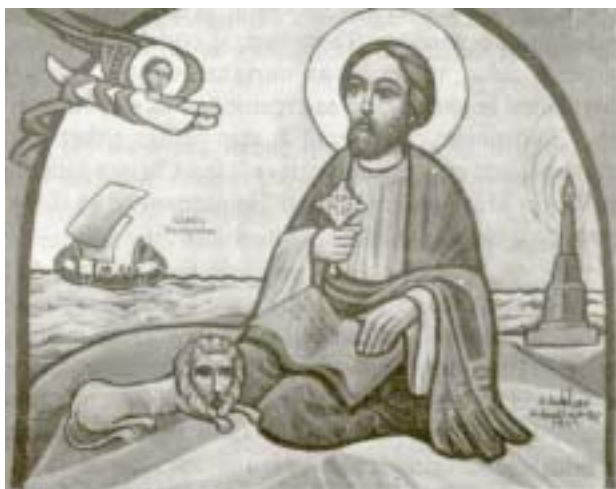
St Mark spent 7 years, 8 months, and 1 day upon the Alexandrian See.