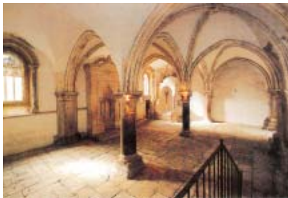
The Church of the top floor of Zion (St Mark's house), where the Lord Jesus Christ met His disciples, and where remains the place of the Passover and the descent of the Holy Spirit at Pentecost.

In the first three centuries there were four main Sees in the world Jerusalem, Antioch, Rome, and