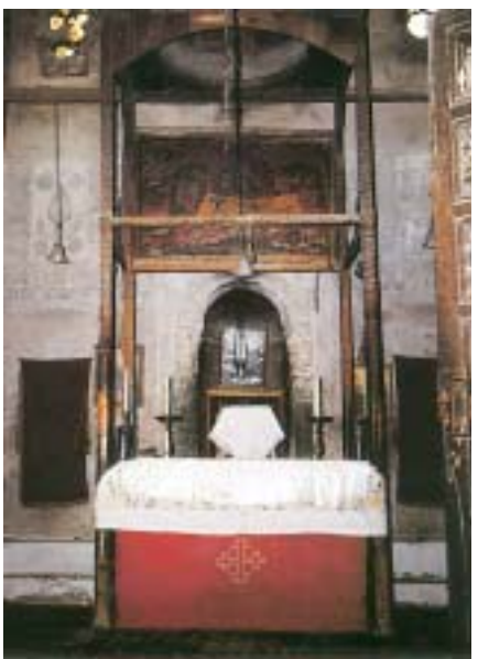
The Altar of the Central Sanctuary dedicated to the Holy Virgin.