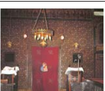
The Church of Qasriat Al-Rihan, Old Cairo, has three Sanctuaries. Above: the Central Sanctuary dedicated to the Blessed Virgin Mary.