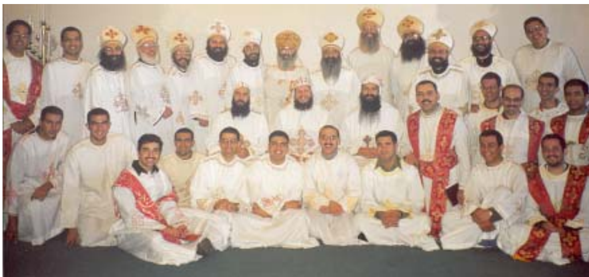
Only priests and deacons are permitted to enter the Sanctuary.