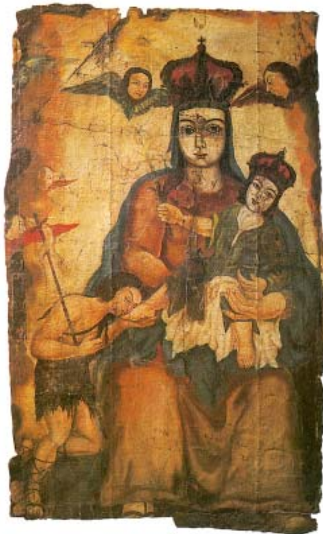
Icon representing Saint Mary, Lord Jesus Christ, Saint John the Baptist at His feet and angels.

St Clement of Alexandria wrote, 'The blessed John, despising the locks of sheep as savoring luxury, chose