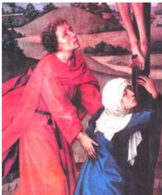
ΣΑ ΠΙΣΤΑΥΡΟΣ ΕΘΟΥΑΒ

They all renounced Him and mocked Him, even one of the two thieves who were crucified with Him on the Holy Cross. However, the Lord found other hearts to love Him, to be faithful to Him and to believe in Him, as He was crucified before them. The first among them was the Holy Virgin Mary, St John the Beloved, Mary Magdalene, and Mary the wife of Cleophas. They were those who remained by the Holy Cross until the last moment, they did not forsake Him, even after His death, when Nicodemus and Joseph of Arimathaea joined them. They were Bethany to the Lord, and He rested in them when all had deserted Him. (Matthew 26:56-57 and John 19:26-27)