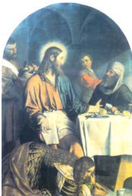
Anointing the Lord's feet Փօռաւ իմ Երկրորդ Բարեգործի մօտ

The house of Mary and Martha was not the only one that the Lord visited in Bethany in those days. Many homes were opened to Him, those of the faithful who were steadfast in their love for Him.