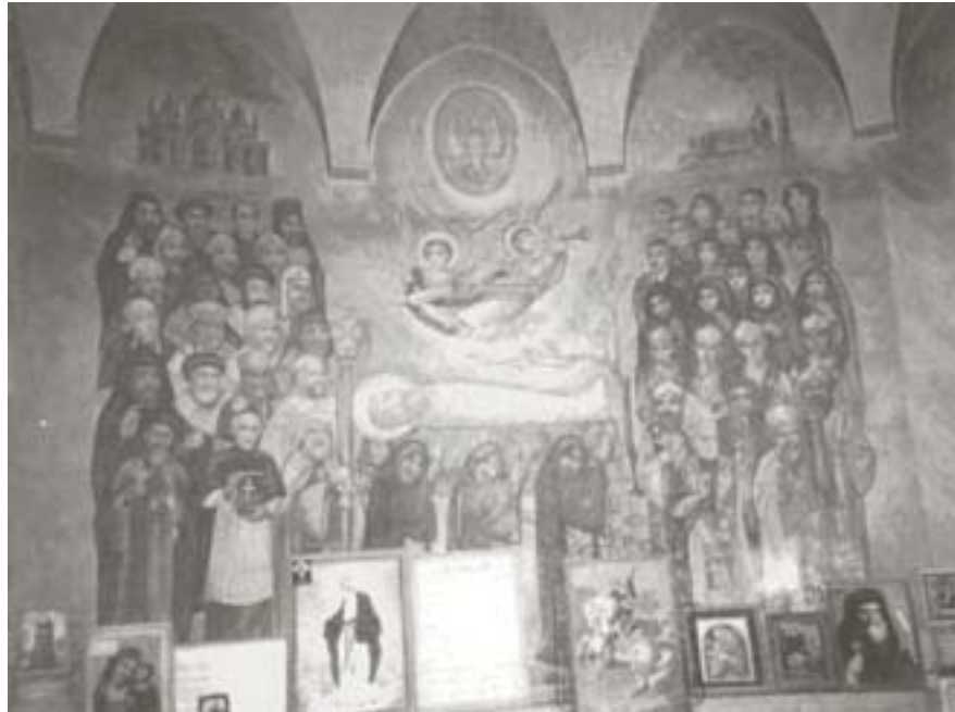
An icon of the transferring of the relics of beloved St Mark from Venice to Cairo located in St Mark Cathedral, Cairo.

martyrdom. All the while during his torture, St Mark prayed, "Thank you Lord because you have allowed me to suffer persecution and torture for Your Holy Name." St Mark near his death requested that the Lord forgive those who brought about his death and then departed from his earthly existence.