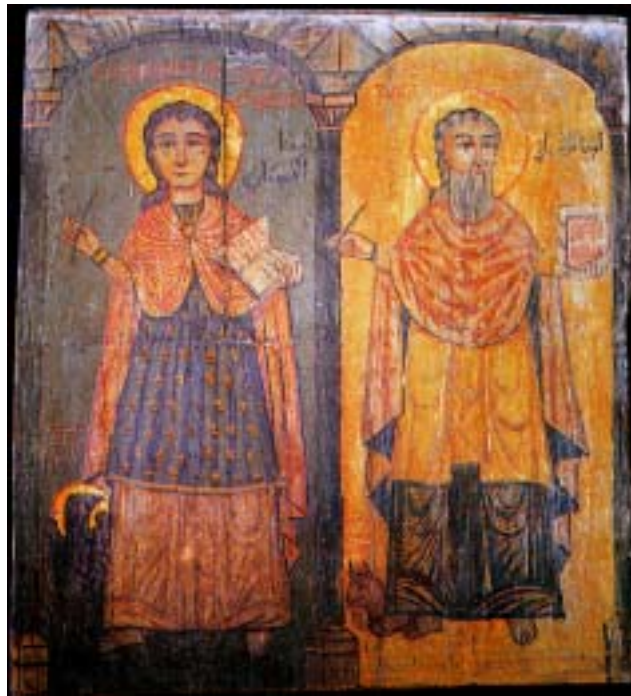
St. John and St. Luke. St. Menas Church. Fum Al’Khalig. Cairo.

They followed the wisdom of Job as he said, “Naked I came from my mothers’ womb, and naked I shall return there.” (Job 1:21) It is the same meaning St. Paul confirmed in the Holy Book of I Timothy 6:7,8.