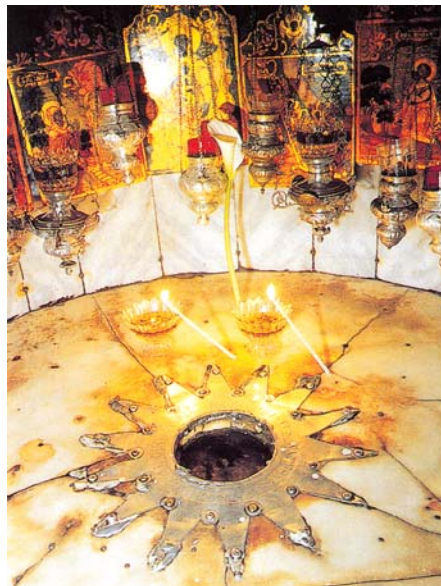
The Site of the Nativity of the Redeemer in Bethlehem

“HERE THE VIRGIN MARY GAVE BIRTH TO JESUS CHRIST”