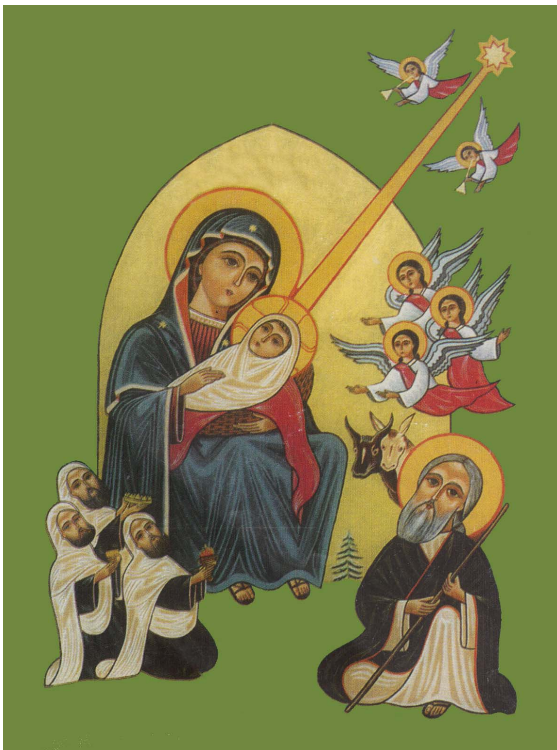
The Nativity of Our Lord Jesus Christ in BETHLEHEM ΠΙΣΙΝΩΙΣΙ ΝΤΕ ΠΕΝΒΟΙΣ ΙΗΣΟΥΣ ΠΙΧΡΙΣΤΟΣ ΞΕΝ ΒΗΘΛΕΕΜ