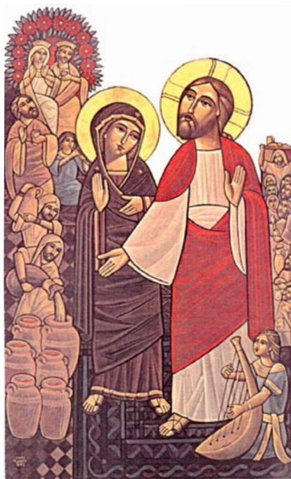
Wedding Feast at CANA