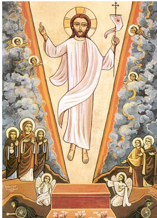
The Glorious Resurrection

Tertullian (c. 207) wrote concerning St. Paul's teachings, "This will be (after the Resurrection for a thousand years) in the divinely-built City of Jerusalem, which is 'let down from Heaven.' The apostle also calls it 'our mother from above.' And, by declaring that our citizenship is in Heaven, he indicates that it is really a city in Heaven. Ezekiel had knowledge of this, and the Apostle John beheld it."