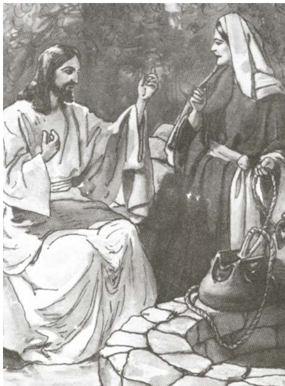
The Samaritan Woman †ϢϢϢϢ ϢρεϢϢαϢρϢα

The Daughters of Jerusalem: We will run after You.