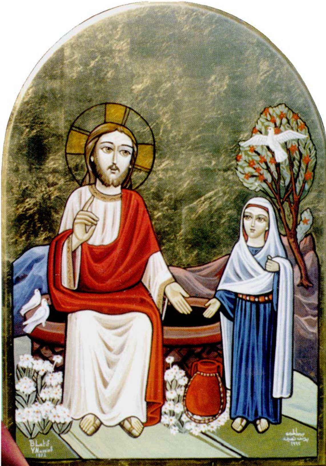
The SAMARITAN Woman ԴՇՆԱՆ ԻՐԵԱՇԱՄԱՐԻԱ