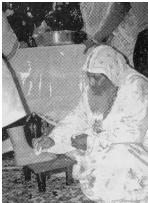
H.H. Pope Shenouda III