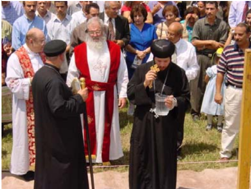
H. G. Bishop Youssef Blessing the Ground of the New Church

August 26 th , HG Bishop Youssef blessed the ground of the new church building by sprinkling water and offering the Prayer of Thanksgiving. The celebration started by a deacons' procession from the old church to the new ground.