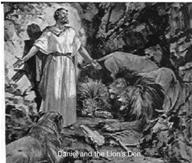
Daniel and the Lion's Den

Esdras 1 draws its background from the Holy Book of Ezra. A debate is found within this writing which occurred among Persian guardsmen as to what was the most powerful force upon the earth. Among the answers were wine, the king, women, and truth. Truth was decided upon.