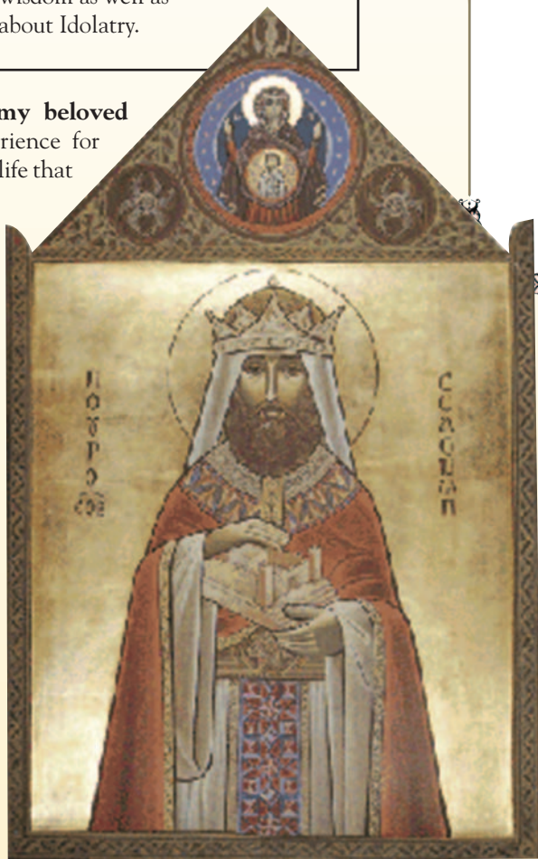
Solomon, Prophet and King, Speaking to God's Mercy, "Buy You, our God, are kind and true, patient and ruling all things in mercy."

Where to start from? In your morning prayers ask God to give you His Wisdom, you may also want to put a little piece of folded paper on the altar with this request.