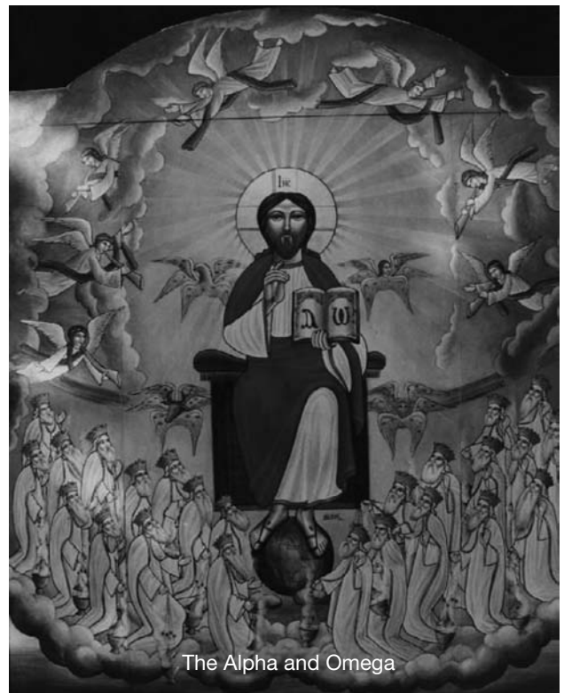
The Alpha and Omega

Jesus Ben Sira’s continuous praise of the Lord is truly exemplified in this last chapter and in his last words; Ben Sira once again selflessly gives advice to his brethren. He says “Let your spirits rejoice in the mercy of God, and be not ashamed to give Him praise; Work at your tasks in due season, and in His own time God will give you your reward.” (51:29-30).