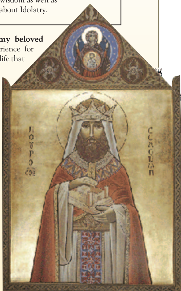
Solomon, Prophet and King, Speaking to God's Mercy, "Buy You, our God, are kind and true, patient and ruling all things in mercy."

The Holy Book of "The Wisdom of Jesus, the Son of Sirach" (or simply "Wisdom of Sirach") or perhaps more widely known as the Book of Ecclesiasticus is mostly made up of unconnect-