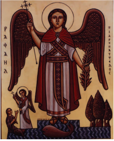
"Tobias and the Angel," represents God being nearer to us than we think. God is ready to assist us if we remain faithful to Him.

Written in Aramaic, the original Holy Book of Tobit was lost for centuries. The Greek translation, existing in three different recensions', is our primary source. In 1955, fragments of the Holy Book in Aramaic and in Hebrew were recovered from Cave IV at Qumran. These texts are in substantial agreement with the Greek recension that has served as the basis for the present translation. This Holy