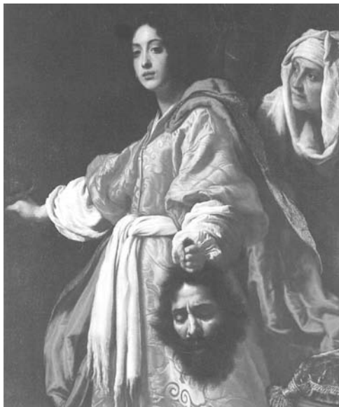
Judith with Holofernes Head

The widow Judith volunteers to deliver the Israelites after rebuking them for losing faith in God when under siege. She goes to the Assyrian camp, pretending to inform them against her people. Holofernes is charmed, and invites her to a banquet in his tent. Holofernes becomes drunk at the banquet, and falls asleep. Judith gets a sword, beheads him, wraps his head in a bag, and takes it to her people. This makes it easy for the Israelites to attack the Assyrians, which now have no leader, and the Assyrians flee in panic. Then they celebrate the victory, and praise the Lord, and go to Jerusalem to offer thanksgiving.