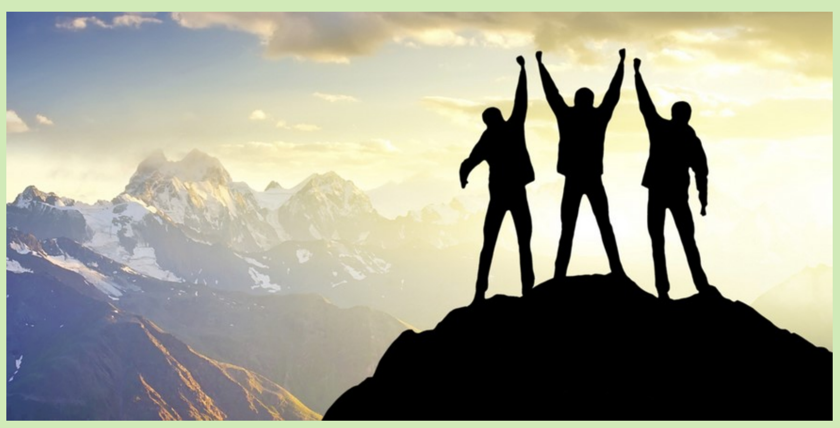
©2016 Coptic Orthodox Diocese of the Southern United States, 501(c)3 organization

Objective: Encourage young people to contend and strive and emphasize the attributes of canonical fight.