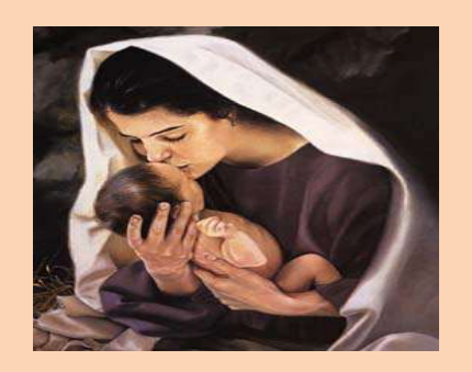
©2016 Coptic Orthodox Diocese of the Southern United States, 501(c)3 organization