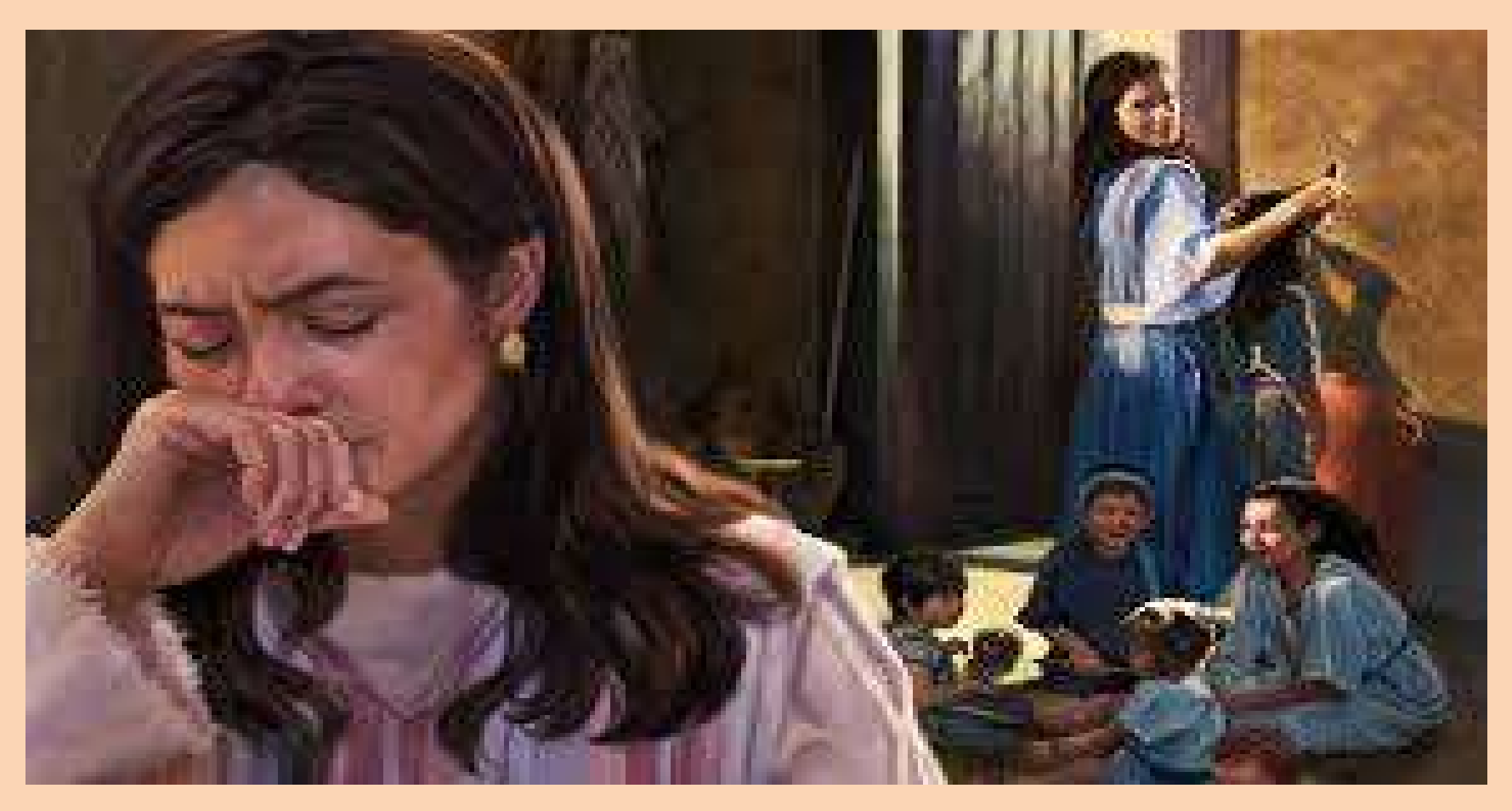
©2016 Coptic Orthodox Diocese of the Southern United States, 501(c)3 organization