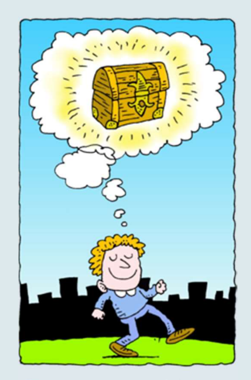
Store your treasure in heaven Matthew 6:20