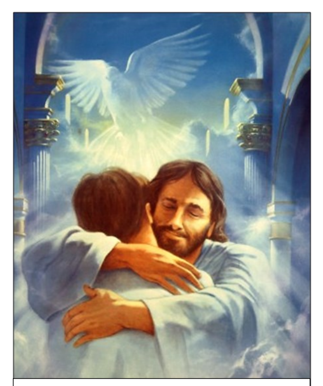
"If we confess our sins, He is faithful and just to forgive us our sins and to cleanse us" (1 John 1:9)