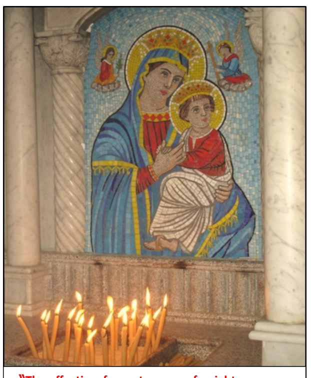
"The effective, fervent prayer of a righteous man avails much" (James 5:16)