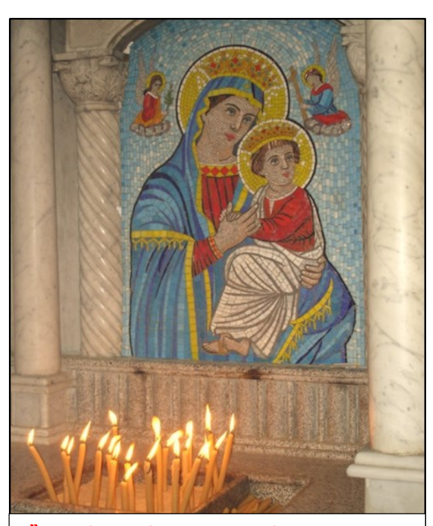
"The effective, fervent prayer of a righteous man avails much" (James 5:16)