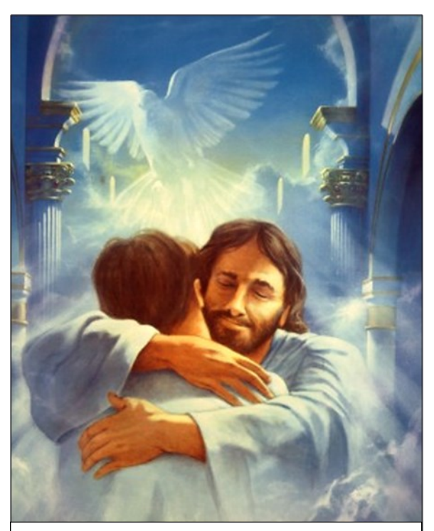
"If we confess our sins, He is faithful and just to forgive us our sins and to cleanse us" (1 John 1:9)