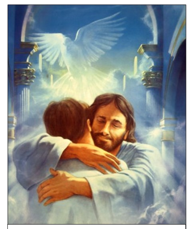
"If we confess our sins, He is faithful and just to forgive us our sins and to cleanse us" (1 John 1:9)