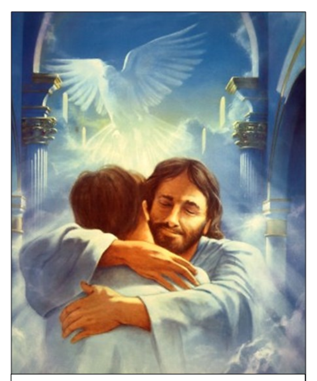
"If we confess our sins, He is faithful and just to forgive us our sins and to cleanse us" (1 John 1:9)