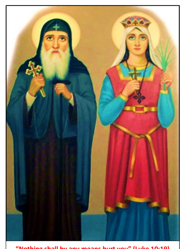
"Nothing shall by any means hurt you" (Luke 10:19)