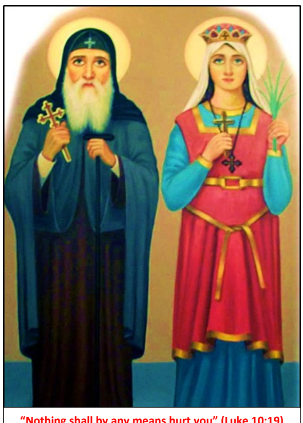
"Nothing shall by any means hurt you" (Luke 10:19)