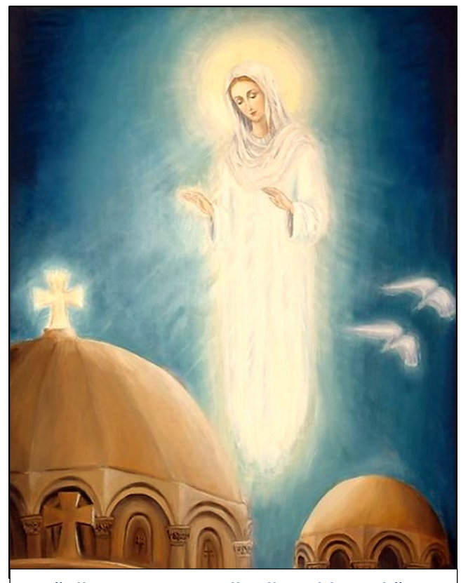
"All generations will call me blessed ".. (Luke 1:48)