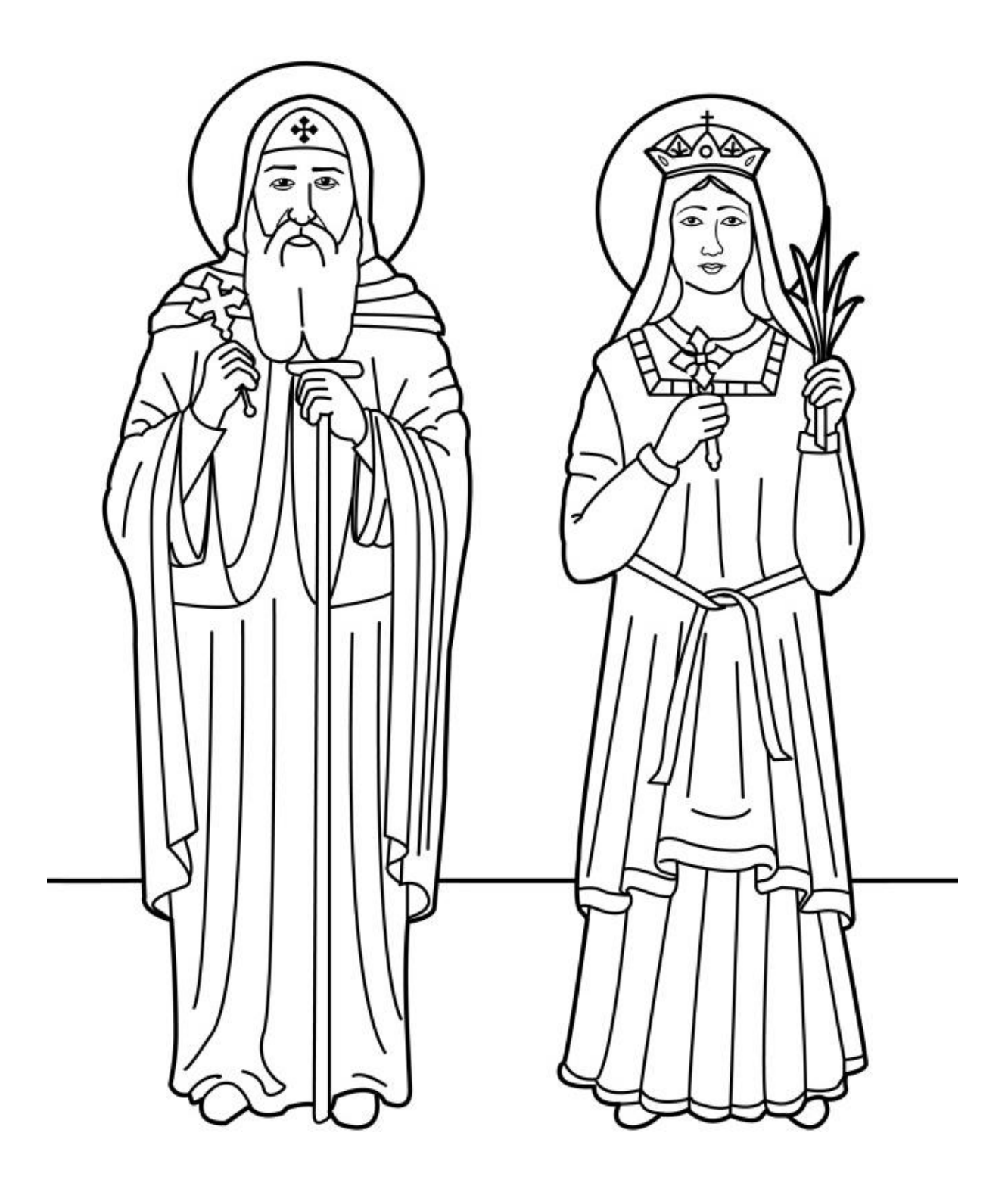
Week 2: St. Youstina