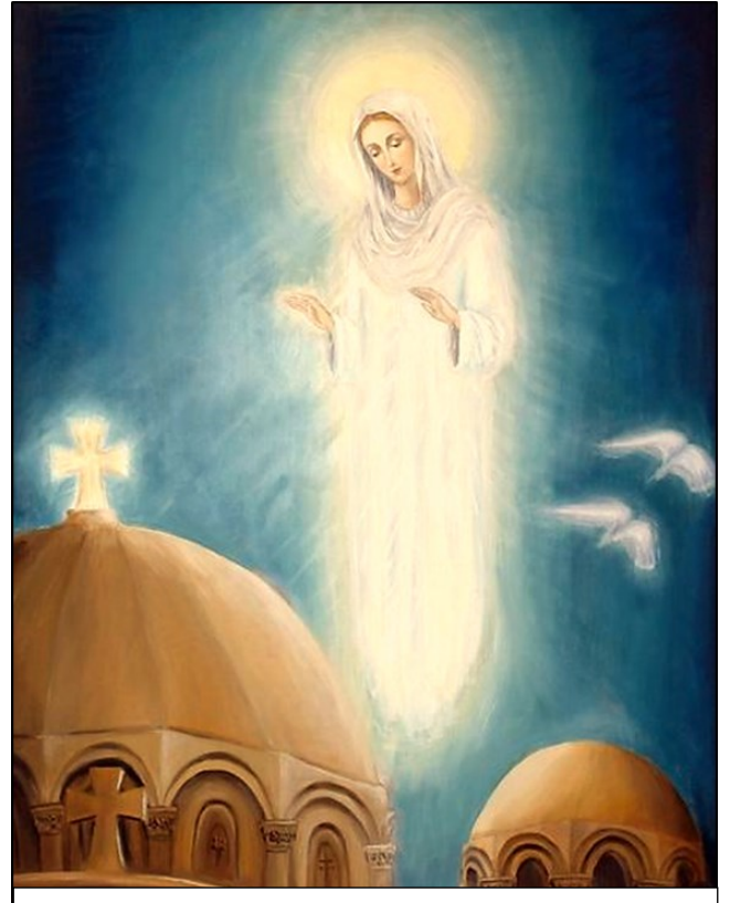
"All generations will call me blessed ".. (Luke 1:48)