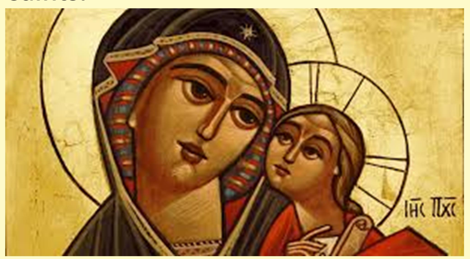
©2016 Coptic Orthodox Diocese of the Southern United States, 501(c)3 organization