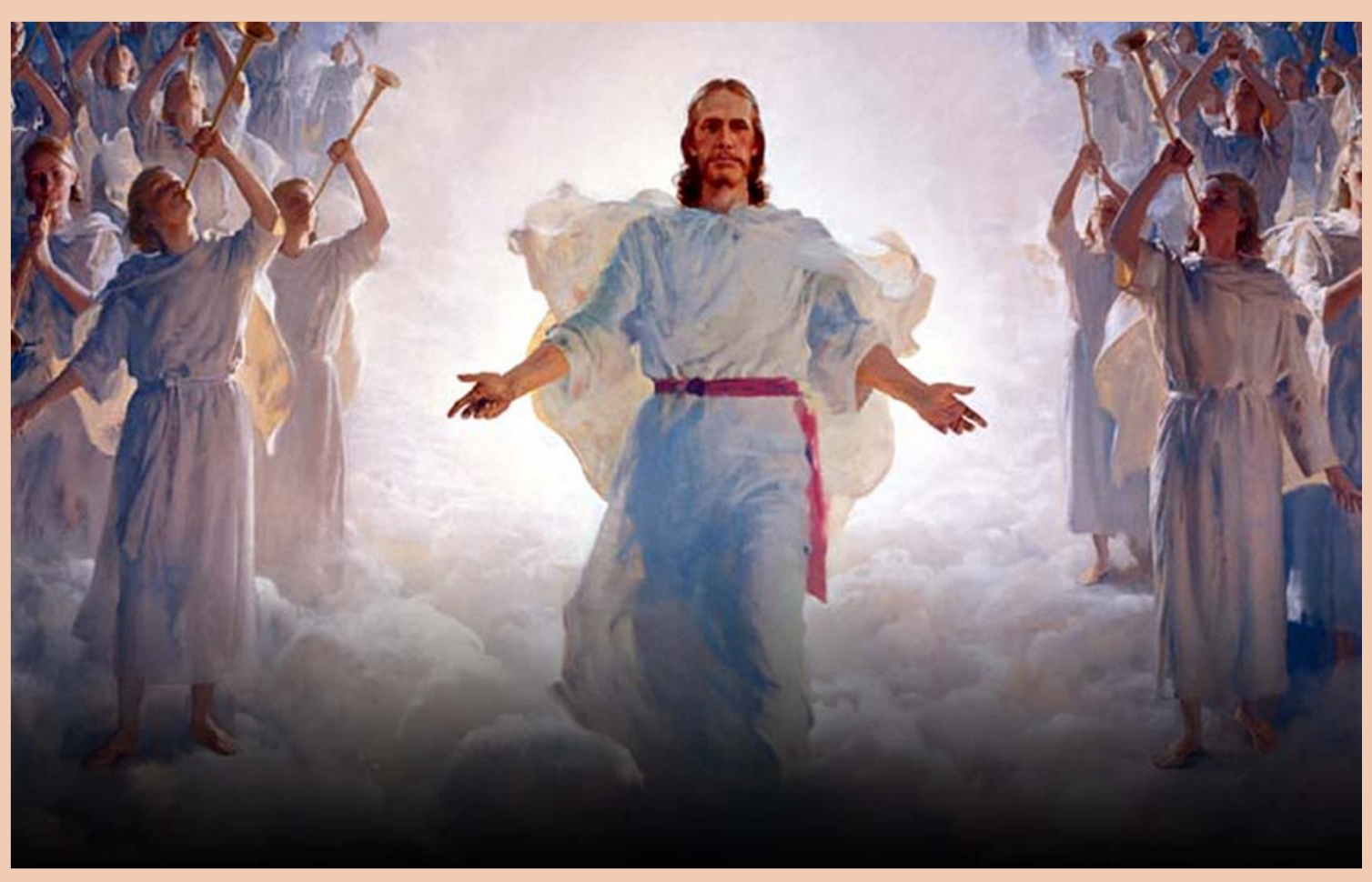
©2016 Coptic Orthodox Diocese of the Southern United States, 501(c)3 organization