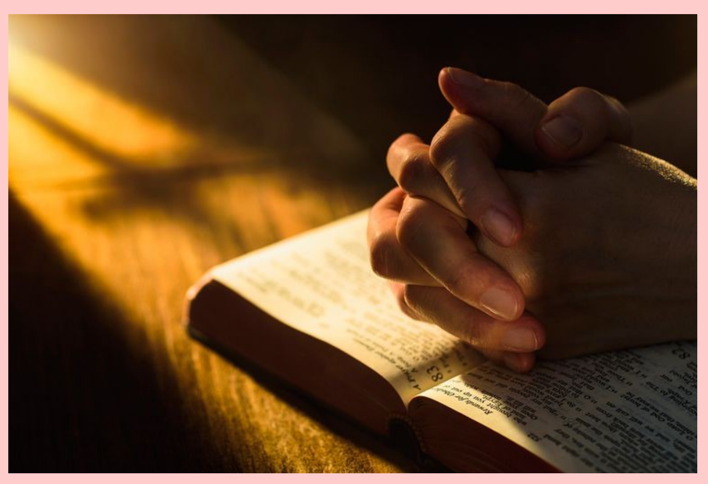
©2016 Coptic Orthodox Diocese of the Southern United States, 501(c)3 organization