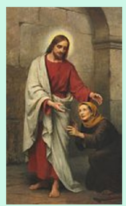
©2016 Coptic Orthodox Diocese of the Southern United States, 501(c)3 organization

Objective: To study the role of women in the New Testament and how Jesus accepted them as treasured members of the human family. To demonstrate the role of women in the early church and the spread of Christianity.