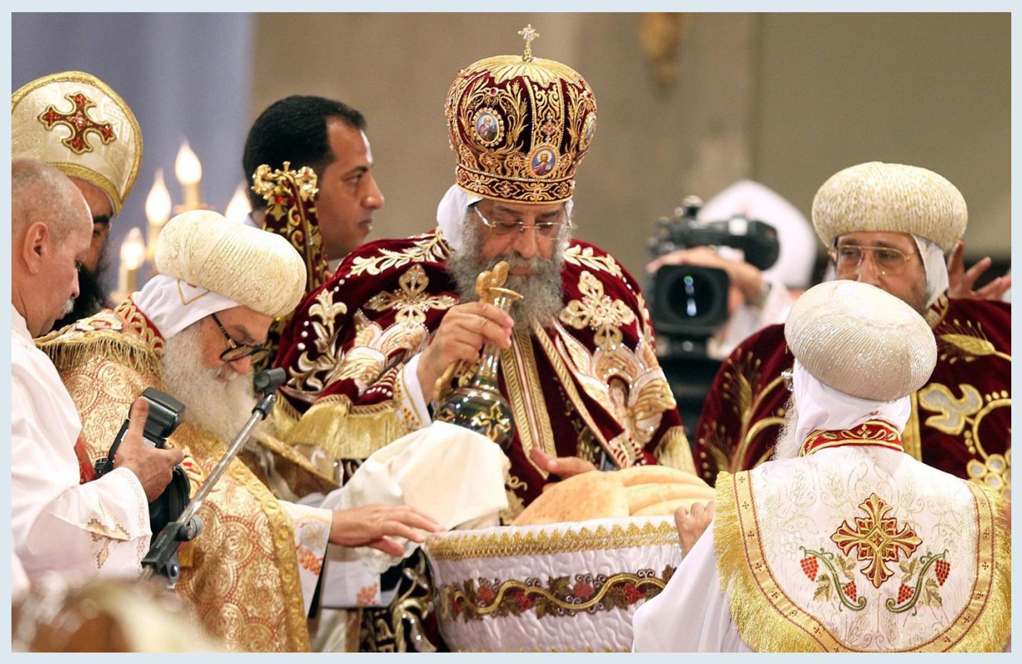
©2016 Coptic Orthodox Diocese of the Southern United States, 501(c)3 organization