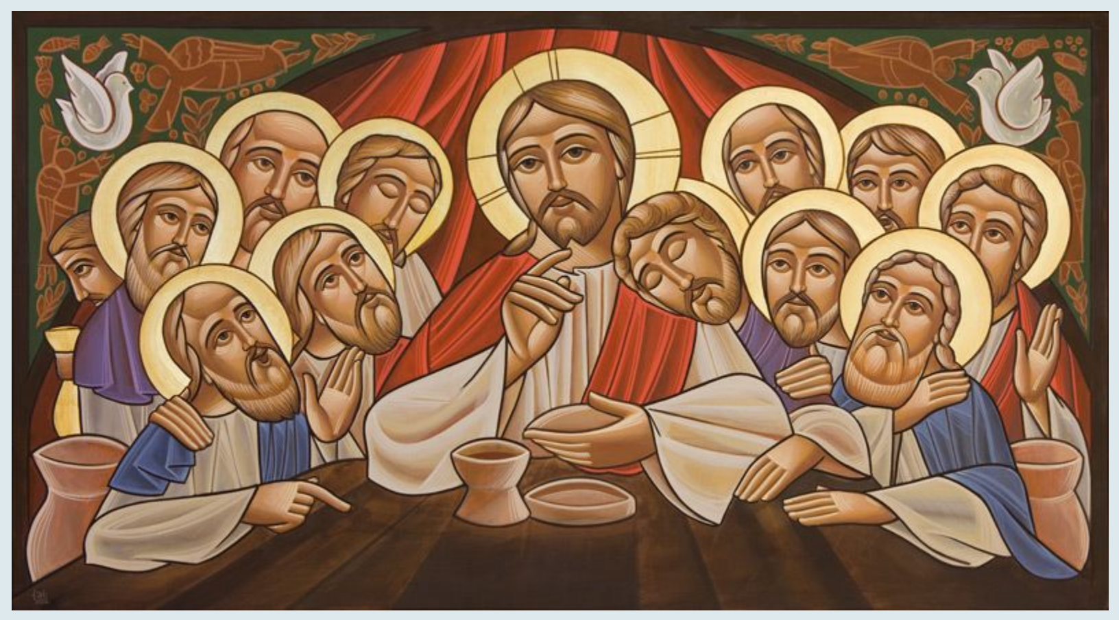
©2016 Coptic Orthodox Diocese of the Southern United States, 501(c)3 organization

Jesus Christ laid the foundation for the church rites. He instituted the sacrament of the Eucharist in the upper room.