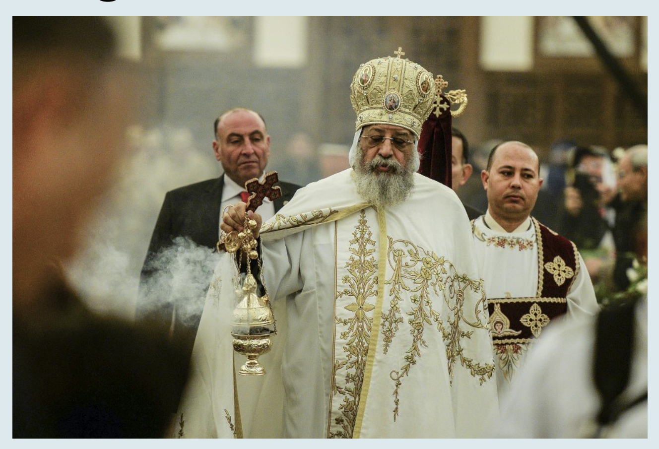
©2016 Coptic Orthodox Diocese of the Southern United States, 501(c)3 organization