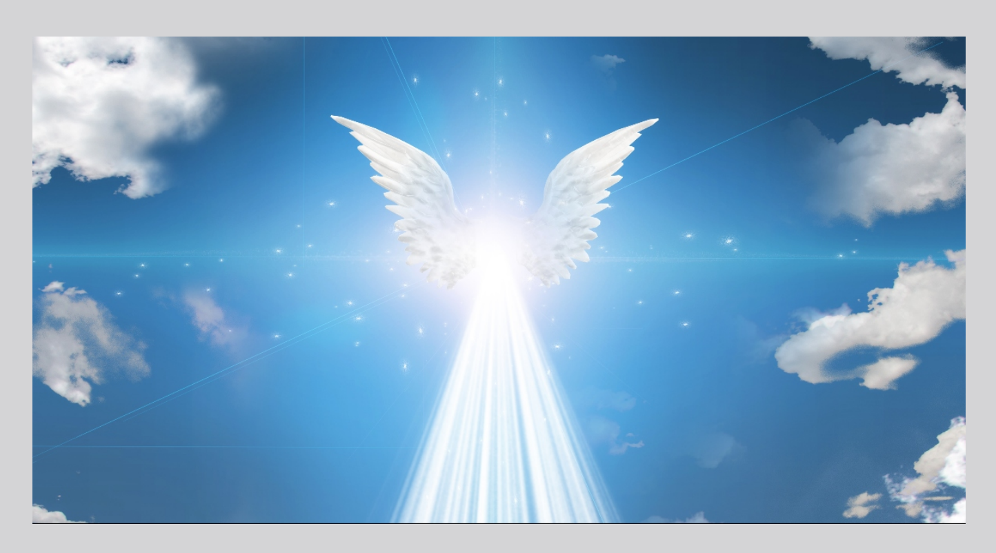
©2016 Coptic Orthodox Diocese of the Southern United States, 501(c)3 organization

Objective: To learn about God's appearances in the Old Testament and how the Lord Jesus Christ was symbolized by different characters in the Old Testament.