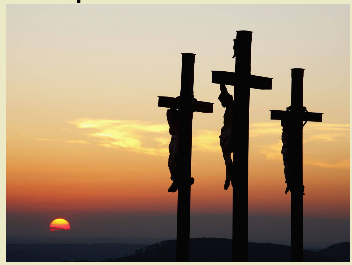
©2016 Coptic Orthodox Diocese of the Southern United States, 501(c)3 organization

Crucifixion was viewed as shameful. Now the cross is a sign of victory, salvation, strength and peace.